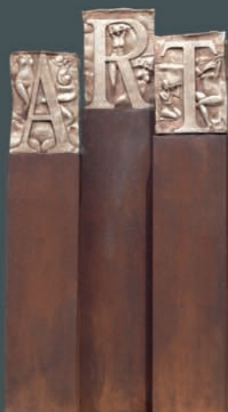
LA RESIDENCIA SCULPTURE GARDEN DEIÀ, MALLORCA, SPAIN